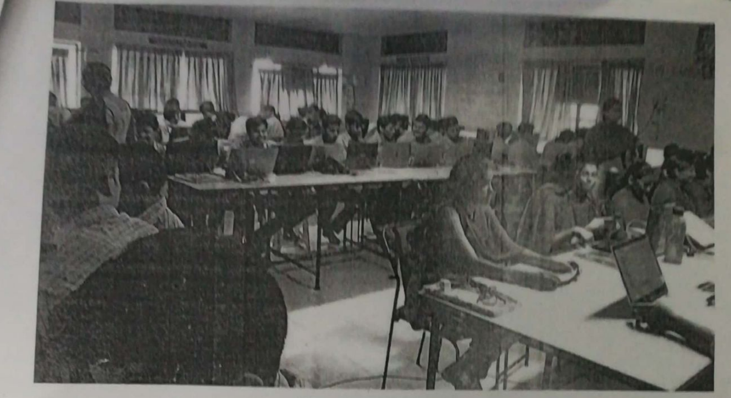
Students Solving the give problem using C