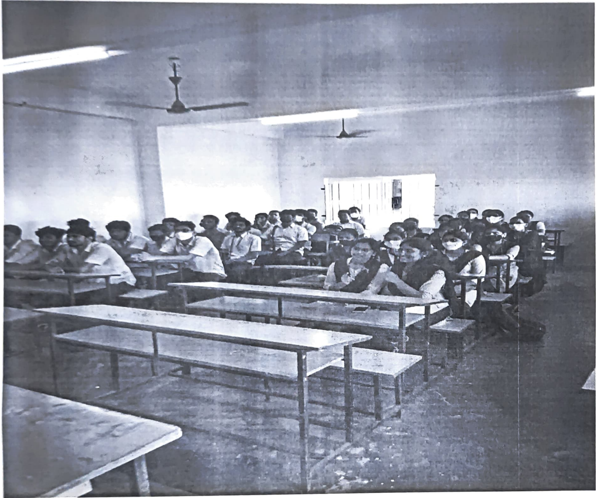
Students attending Seminar on Soft skills