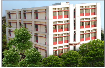
CSE Department (C-Block)