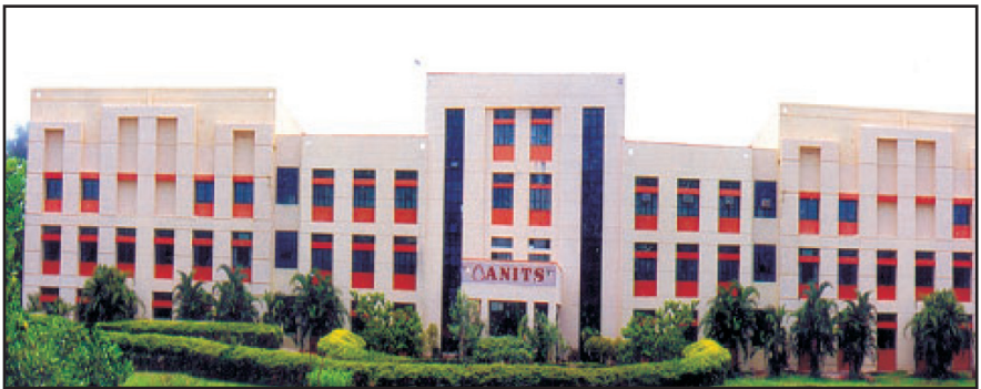
Administrative Block (A - Block)