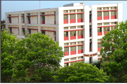
ECE Department (B-Block)