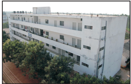
I.T. Department (G-Block)