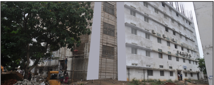
Civil Engineering (H - Block)