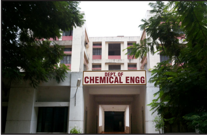
Chemical Engineering (D-Block)