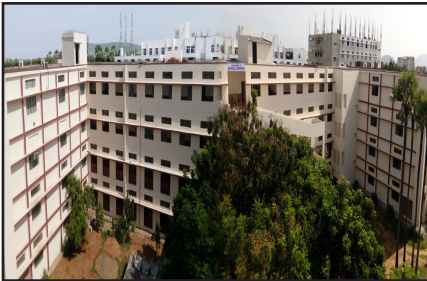
Mechanical Engineering (F-Block)