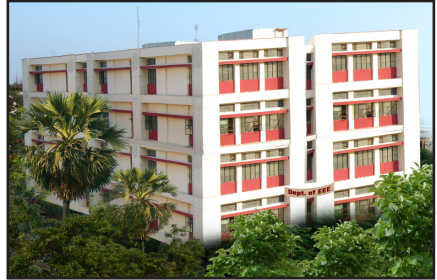
EEE Department (E-Block)