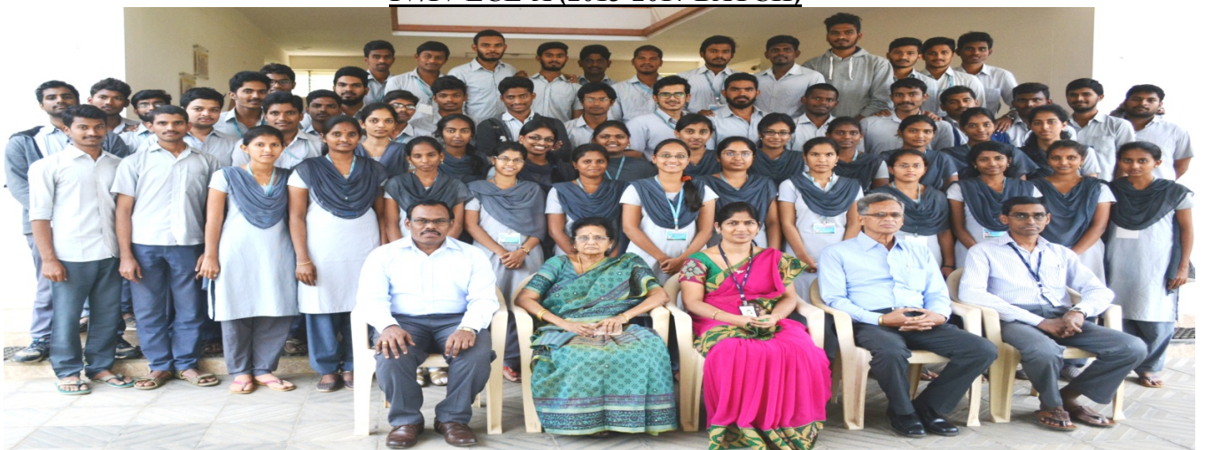
IV/IV ECE-B (2013-2017 BATCH)