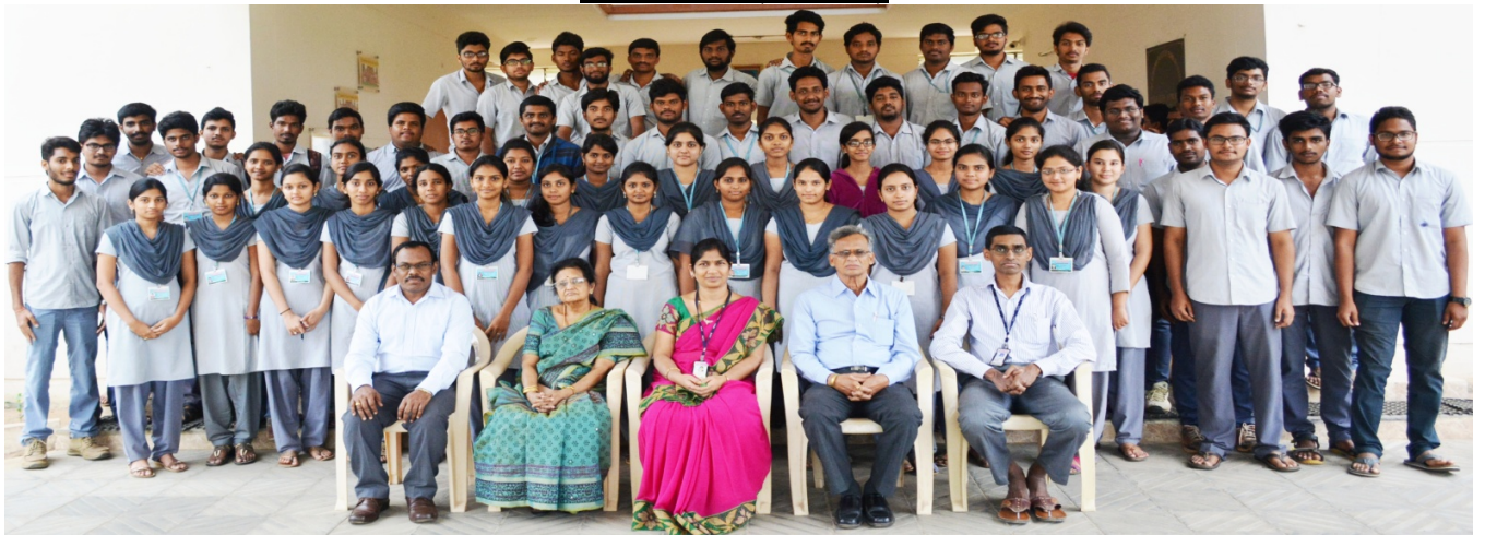
IV/IV ECE-A (2013-2017 BATCH)