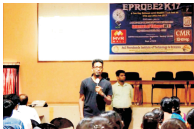
Workshop on IOT (Internet of Things)

National Level Student Symposium EPROBE-2K17A Two day national level student symposium- EPROBE-2K17 has been conducted by ACES team of department of ECE. As part of the symposium, 2 day workshop on Quadcopter, 2 day workshop on IOT (Internet of Things) and "Swadesh-Summit" program towards cleanliness of India were organized.