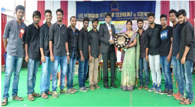
Students from ECE won Cricket tournament trophy for third time (Hat trick) in college sports event.