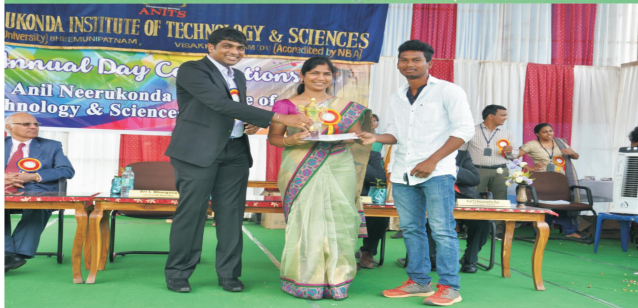
Over all Championship from Boys & Girls in both Categories.