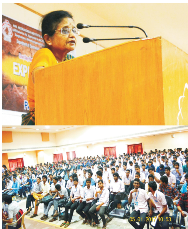
A National Level Quiz competition EXPLORE 2K17