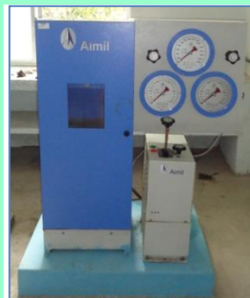
Compression Testing equipment