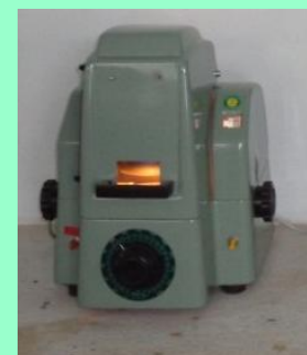
Infra-red Moisture meter