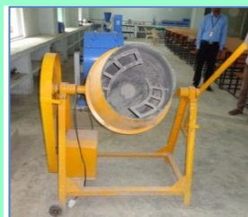
Laboratory Concrete Mixer