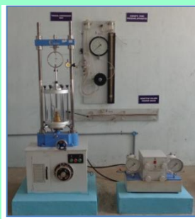
Triaxial Compression Test equipment