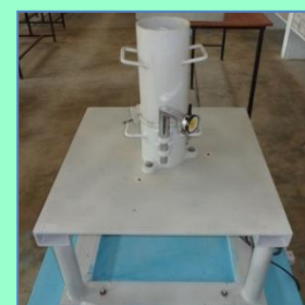
Relative density equipment