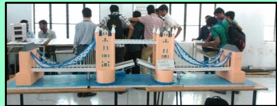
Civil Engineering Model contest and Exhibition