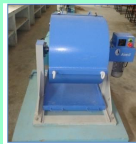
Los Angeles Abrasion testing machine