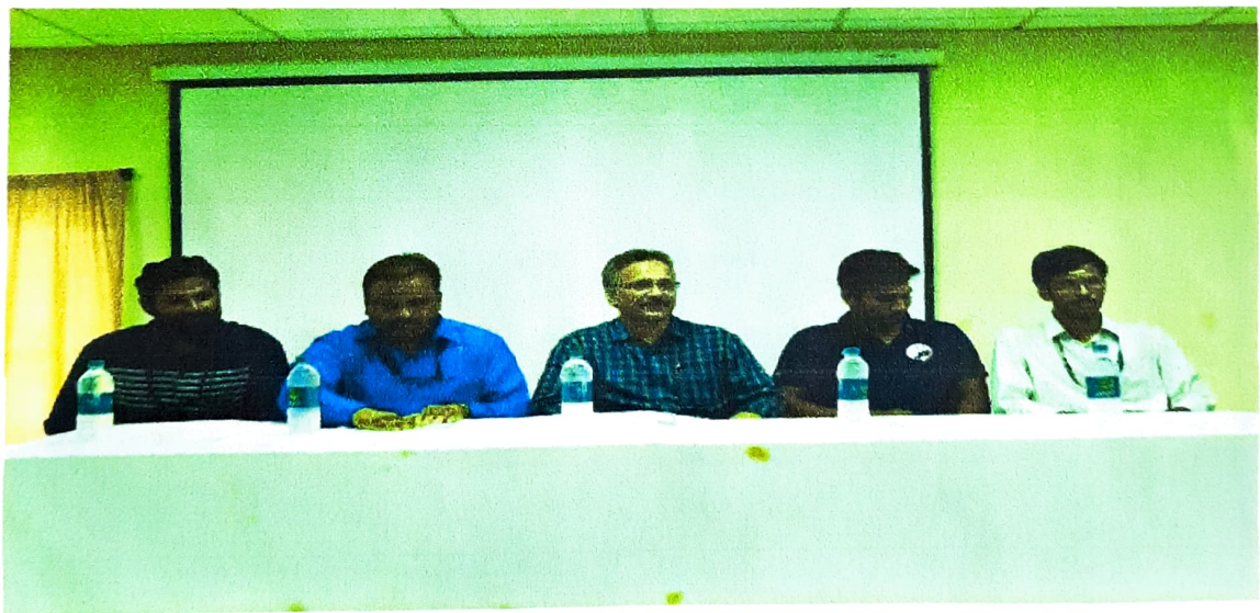
Respected dignitaries on stage