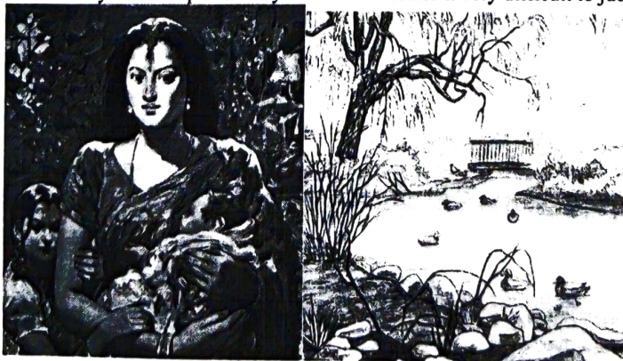
Students art photos 1) Save Girl child 2) Nature pencil sketch