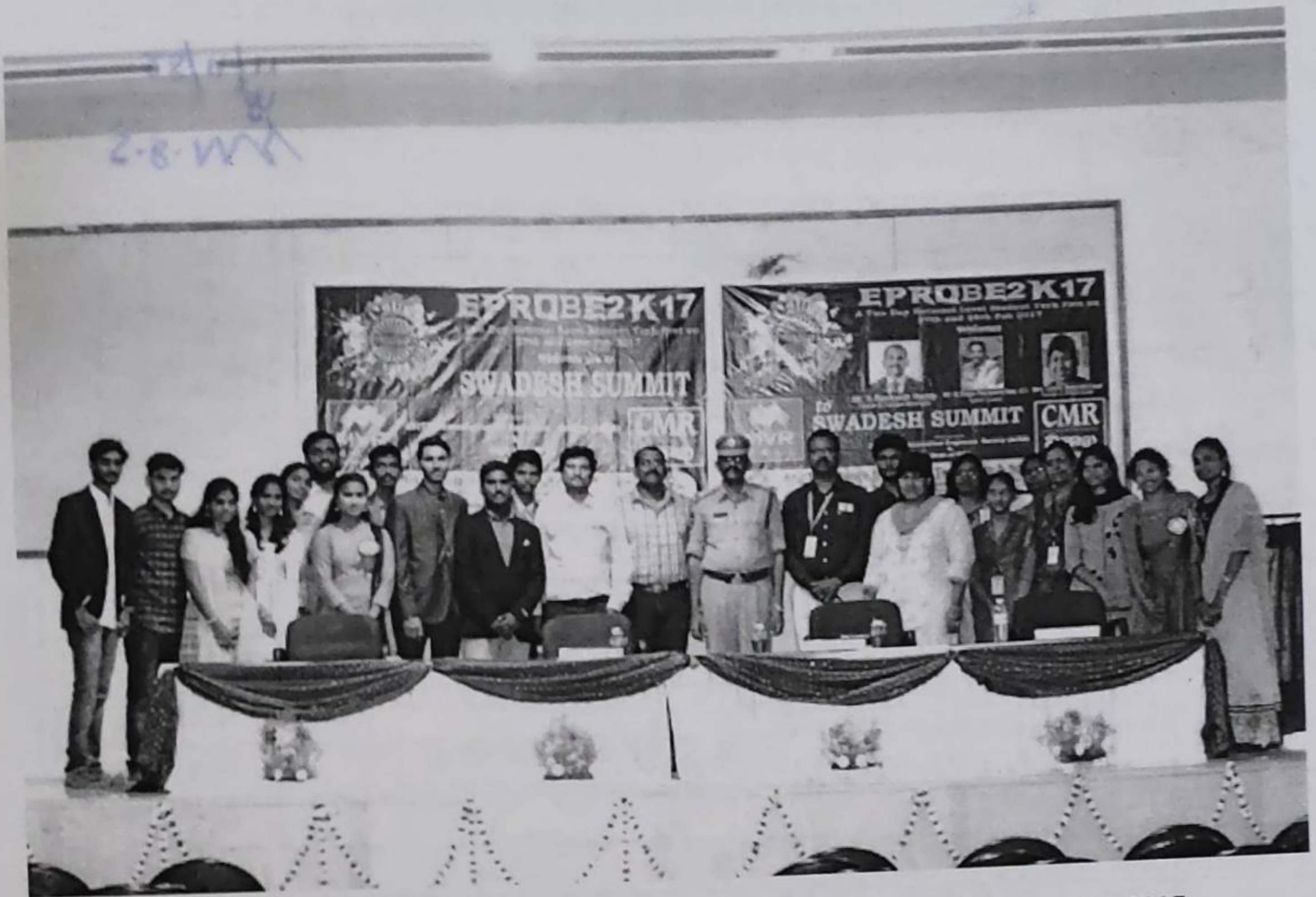
“SWADESH SUMMIT” Program towards cleanliness of INDIA was organized on 28-02-2017