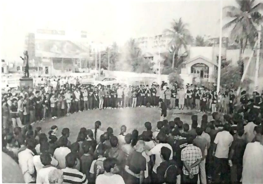
Fig: Awareness program on "Health and Fitness" on 25-02-2018