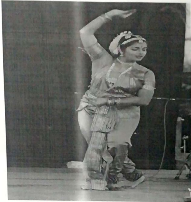
Fig: Classical dance performance during Tachyon 2k18