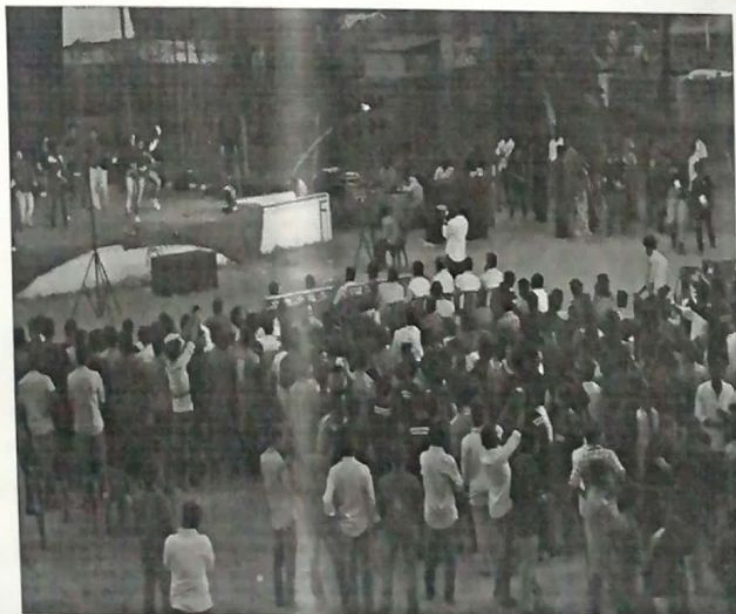
Fig: Cultural festivities during Tachyon 2k18