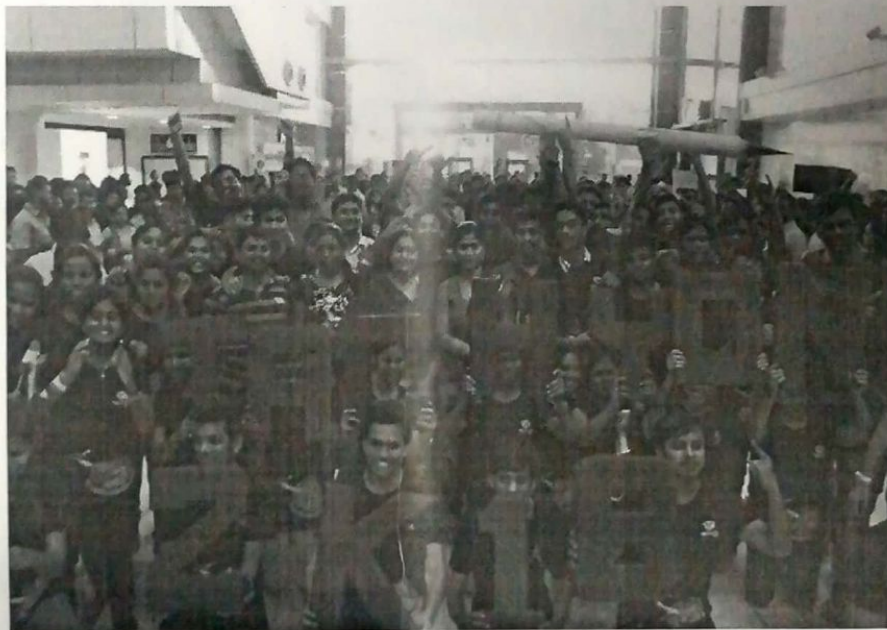
Fig: Flash Mob at CMR Central promoting "Unity in Diversity" on 25-02-2018