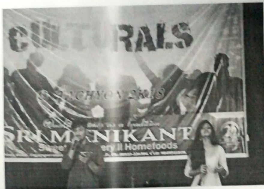
Fig: Film singer Satyanarayana crooning for another song during Tachyon 2K18