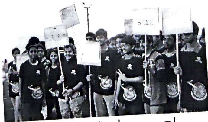
Students displaying Placards

The run was started at 6:30 AM from Kaalimatha Mandhir to The Park circle (taking U-turn) and back to YMCA(ending point). There were nearly 400 participants who participated in the run. Students have displayed placards related to Health and Fitness. The team has distributed water bottles to all the participants after the run. The Top 6 runners(3 Boys, 3 Girls) were awarded medals as a token of appreciation from The Principal and HOD, ECE at YMCA. Our beloved Principal has addressed the gathering with his kind words and appreciated all the participants who participated and the Tachyon Team for conducting this campaign.