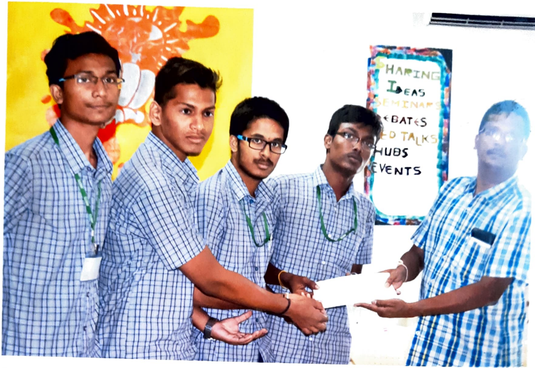
Winners Of Quiz Conducted On the eve of "WORLD'S STUDENT'S DAY"