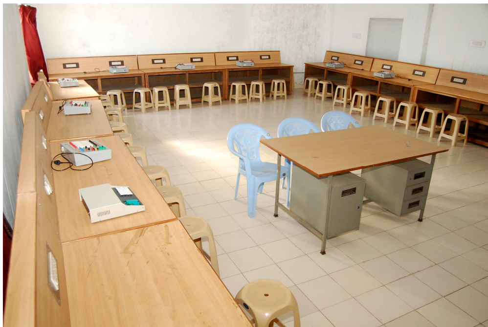
C O Lab