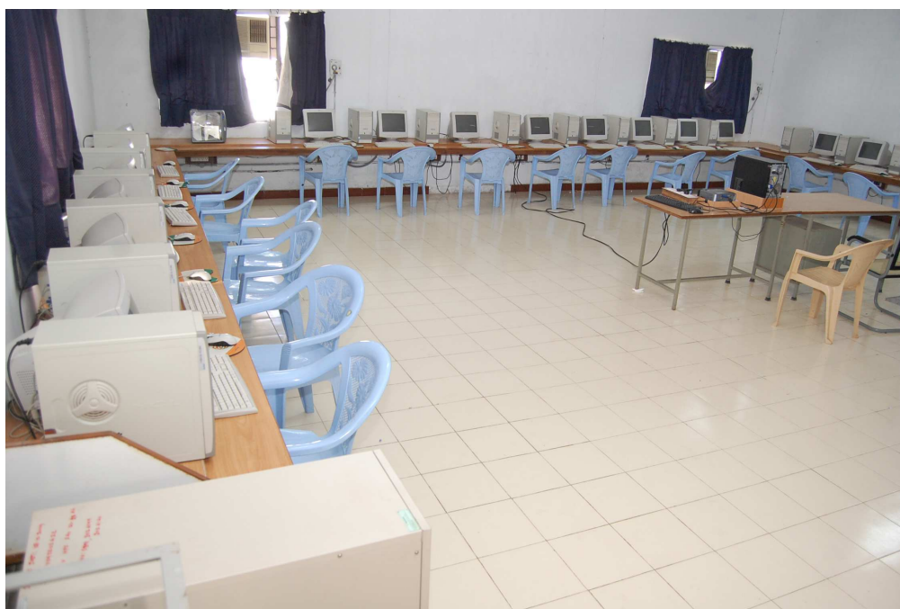
Computer Lab I