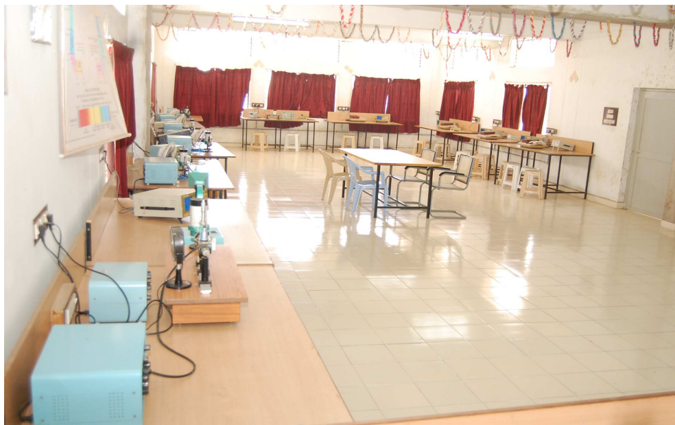
Micro wave lab