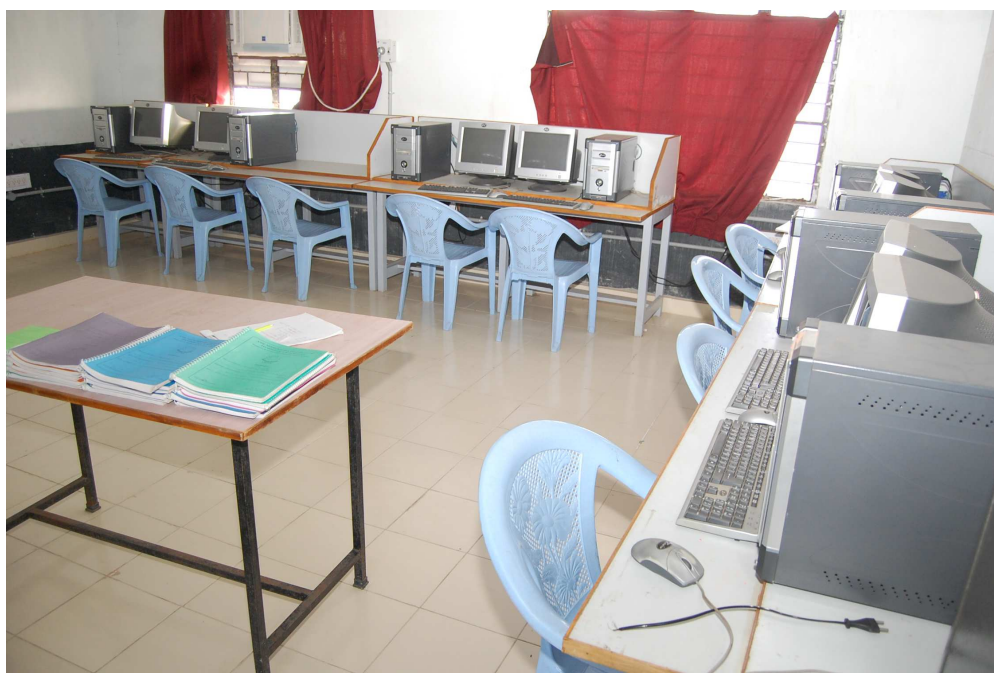
Data Communication Lab