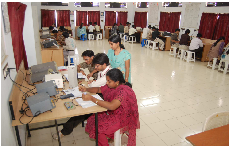
Electronic Devices & Circuits lab