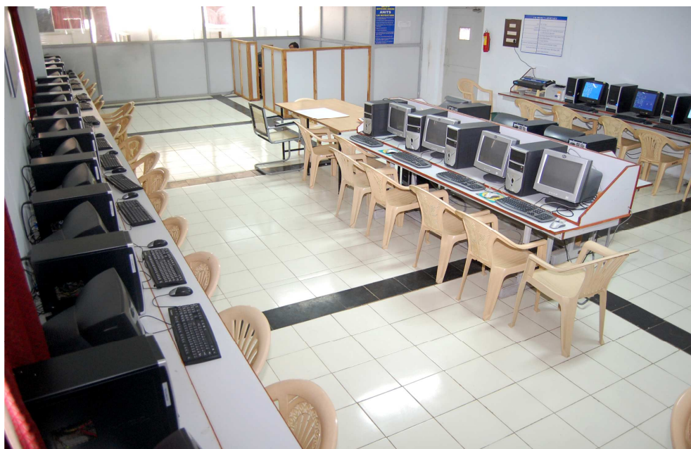
CSE Lab 1